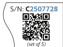
Serial number S/N and QR code