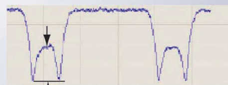
AFM scan profile showing divots**